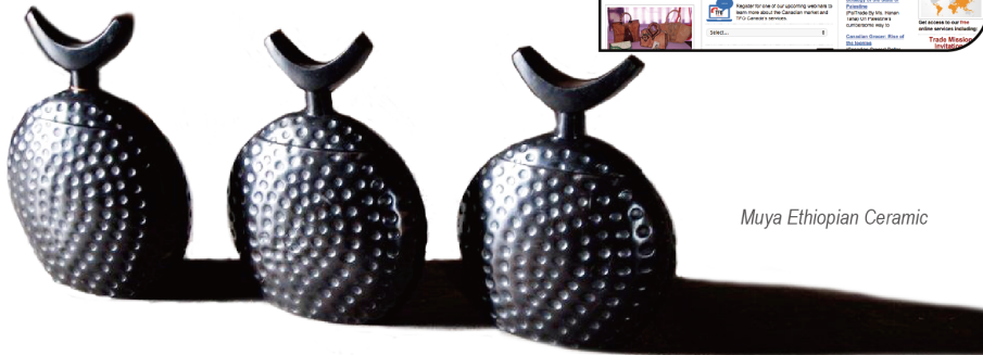
Muya Ethiopian Ceramic